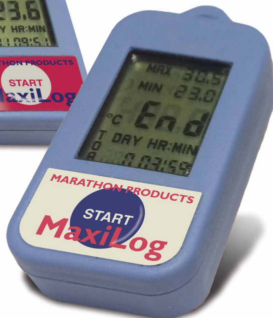
Multi-use SKU #7026