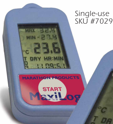
Single-use SKU #7029