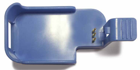
Maxilog MaxiThermal2 Reader Station

Please call 1-510-562-6450 for more information or to place an order.