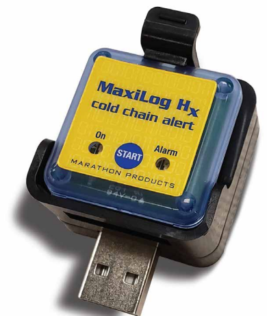
USB Reader Station SKU#9052

1-510-562-6450 ■ www.marathonproducts.com